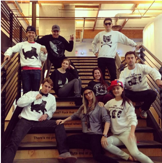
Deutsch LA

You mentioned you had a “chip on your shoulder.” Could you speak more about that?