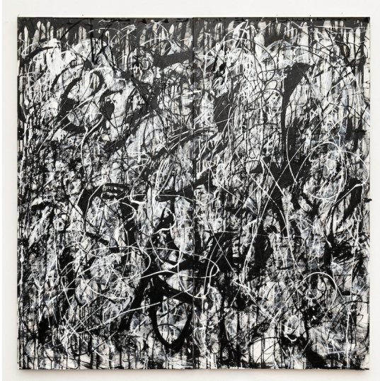
Antithetical Couplet No. 2 - 对偶, Acrylic and Chinese Ink on Canvas, 2020. Courtesy of Xavier Teo.