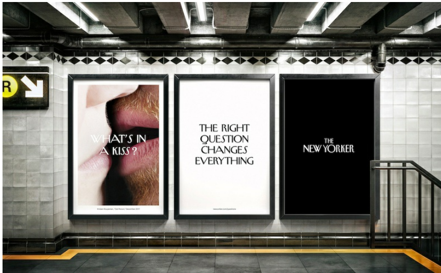
The New Yorker Brand Campaign, NYC 2020.

You moved to New York, and most recently worked at CNX, the creative agency of Condé Nast. What was the experience like working with Anna Wintour?